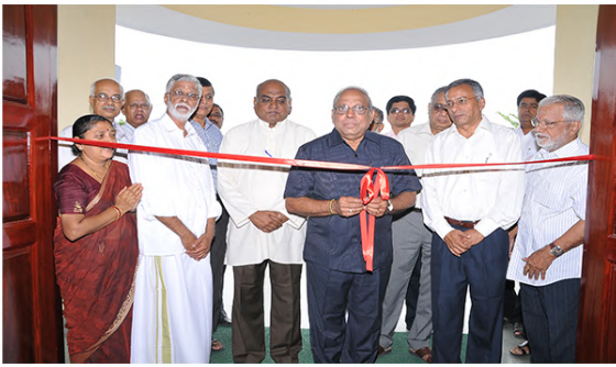
Inauguration of College Main Building