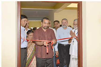
Inauguration of Kanchi Maha Periya Library