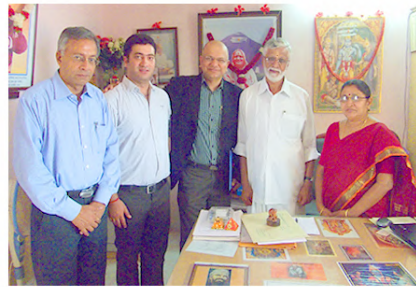
Inauguration of House Electrician Lab sponsored by Schneider Electric Foundation