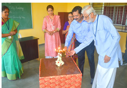
Inauguration of Tally Lab sponsored by YENNES Infotech Pvt Ltd