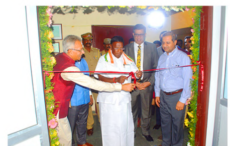
Inauguration of Computer Hardware Servicing Lab sponsored by Dell India