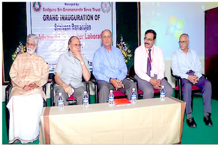
Inauguration of Ramanujam Computer Lab Sponsored by Cognizant Foundation