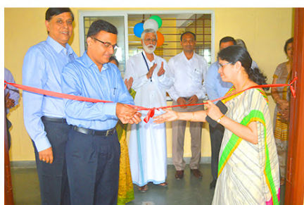
Inauguration of Instrumentation Lab sponsored by Siemens