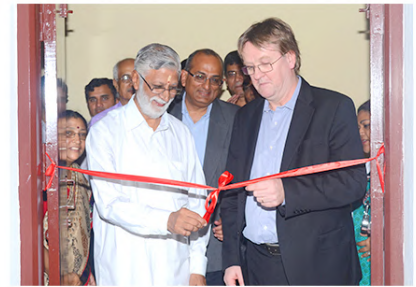
Inauguration of Ref & AC Lab sponsored by Danfoss