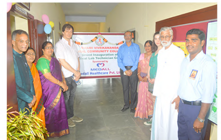
Inauguration of Medical Lab Technician Lab sponsored by Medall Diagnostics