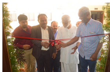
Inauguration of Two Wheeler Technician Workshop sponsored by Yamaha Technical Academy