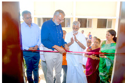
Inauguration of Plumbing Lab sponsored by Grundfos Pumps