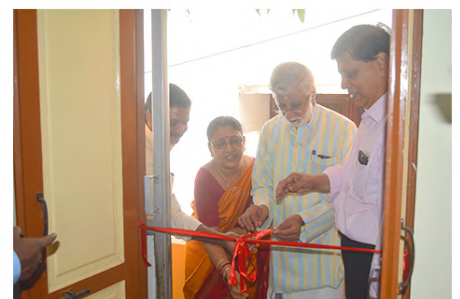
Inauguration of SVRCC - City Center in collaboration with YENNES Infotech Pvt Ltd