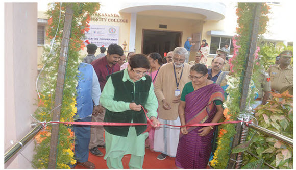
Inauguration of College Workshop Block